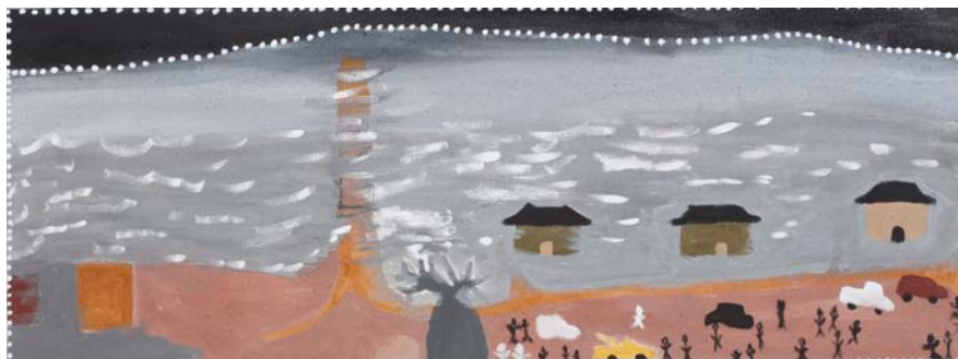
ROBERTA DAYLIGHT, WARAMBANY(WARMUN FLOOD) , 120 x 45 cm, Natural ochre and pigments on canvas