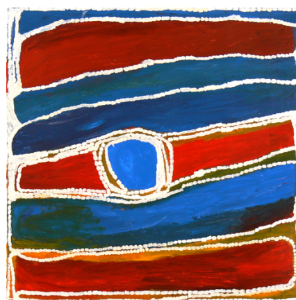
Warnti 2007 Acrylic on canvas 90 x 90 cm