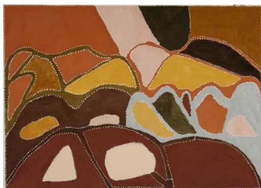
PATRICK MUNG MUNG Ngarrgooroon 140 x 100 cm Natural ochre and pigment on canvas