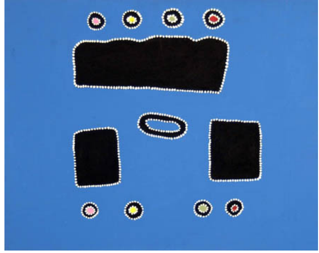
RAMMEY RAMSEY, BULL HOLE (WARLAWOON COUNTRY) , 80 x 100 cm, charcoal and synthetic polymer on plyboard