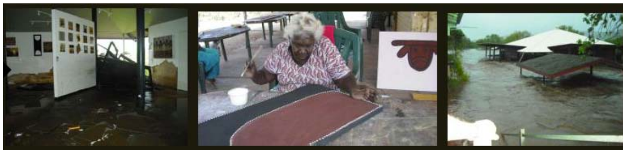
Images of the Warmun Art Centre flood