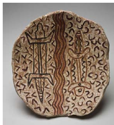
Kambel the crocodile and Pa'u the blue tongue lizard exchanging teeth. 31 x 30 Cm Raku clay, mid range firing. Oxide under opaque glaze