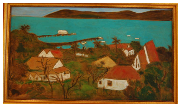
RAY CROOKE Old Ti 34 x 60 cm Oil on canvas