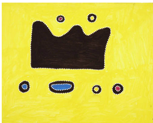
RAMMEY RAMSEY Rocky Bar (Warlawoon Country) 80 x 100 cm Synthetic polymer on plyboard